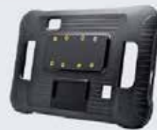
RB-P80-RR Rugged Rubber Boot